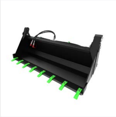
4 in 1 bucket